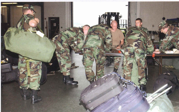
Members of the 123rd Airlift Wing drop off their gear at the aerial port squadron for palletizing and on-loading to the aircraft.